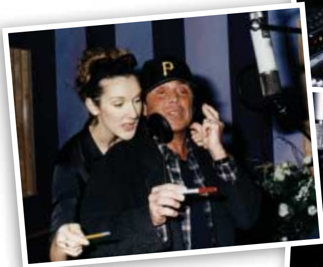
On his 1998 CD "A Body of Work," Anka's collaborators included Ricky Martin, Celine Dion and Tom Jones